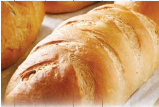
Robert's Own • Baked Fresh In Store Crusty Italian Bread 18 Oz. Loaf