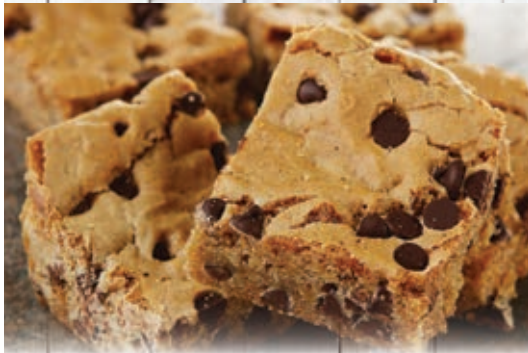
Robert's Own • Sweet Treat Favorite! 5 Count Brownies Chocolate Chip, Brookie, Cream Cheese or Blondie